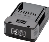
Battery 18V 2 AH (BPL-1820)